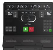
UNITE LED LED CONSOLE