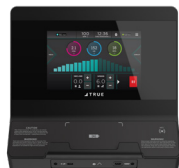
UNITE 10" TOUCHSCREEN