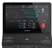
UNITE 16" TOUCHSCREEN