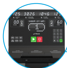
Multiple console options